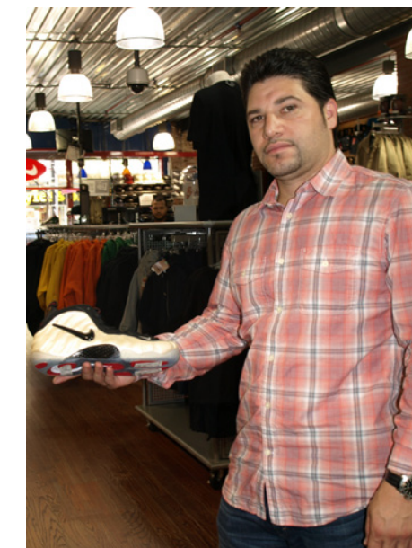
BX Sports carries the world's most popular brands of athletic shoes and footwear.

Today, the footwear brands at BX Sports cover a wide range from Hush Puppies to Timberland and many more. We keep updating the footwear as manufacturers introduce shoes, sneakers and boots that are lighter weight and more durable and feature colorful materials.