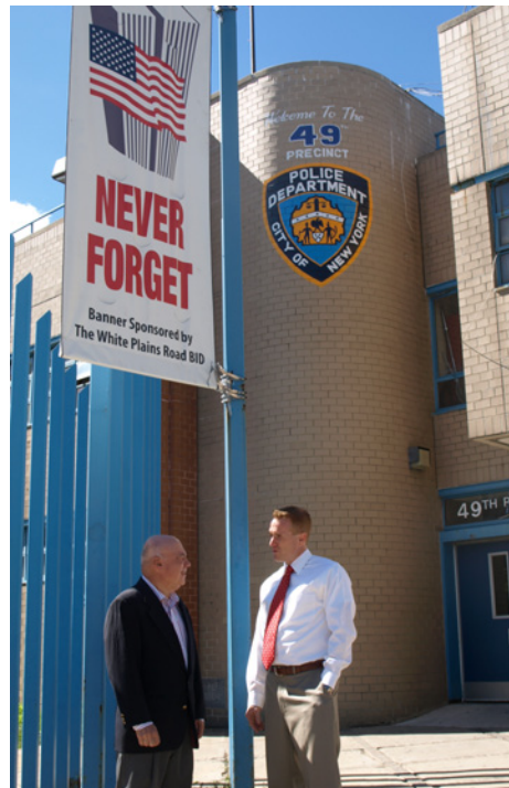
White Plains Road BID presented the 49th Precinct with the banner that pays tribute to the fallen heroes of September 11th.

In addition, representatives of the 49th Precinct meet regularly with numerous civic, community and neighborhood groups. For example, the Precinct Community Council meets at different neighborhoods on the last Tuesday of each month at 7:30 p.m. to discuss the area's concerns that need to be resolved.