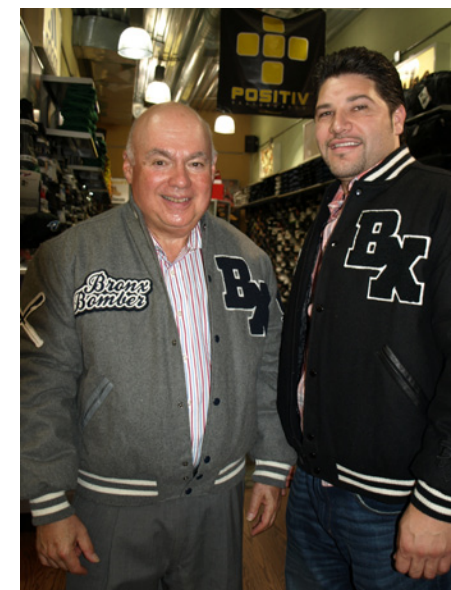
BX Sports recently introduced its custom-designed version of the classic varsity jacket.

VC: First, everyone at BX Sports is focused going above and beyond for our customers. One of the ways we meet and exceed our customers' expectations is by looking for new trends and what's hot.